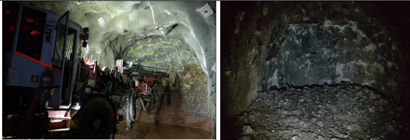
Photo Desc Development Jumbo boring the face Photo Desc Muck Pile following firing after re-entry